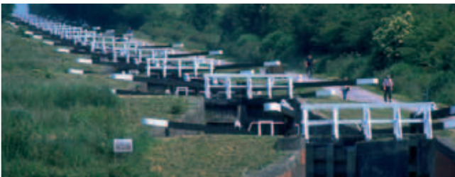
Woodborough to Devizes