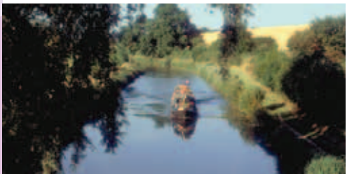
Foxhangers Bridge to Devizes

■ Each bus is wheelchair accessible and buggy friendly. We also welcome well behaved dogs on board our buses.