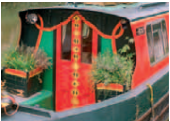
Bishops Cannings to Devizes