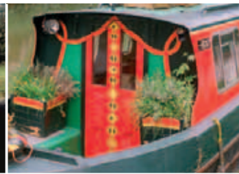
Wootton Rivers to Pewsey