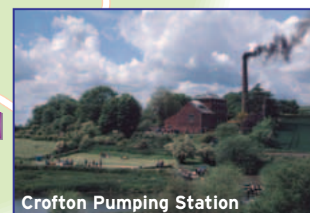
Crofton Pumping Station