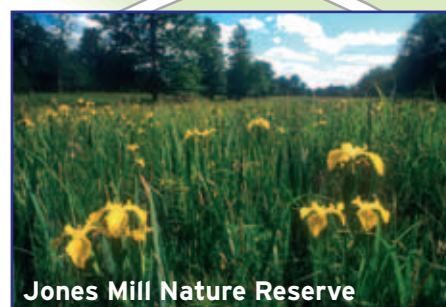
Jones Mill Nature Reserve