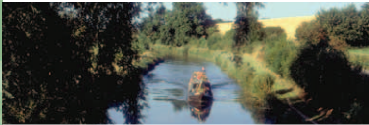
Wilcot to Pewsey

■ Each bus is wheelchair accessible and buggy friendly. We also welcome well behaved dogs on board our buses.