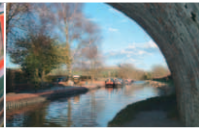
Crofton Pumping Station to Pewsey