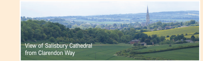
View of Salisbury Cathedral from Clarendon Way