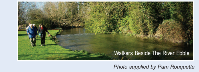
Walkers Beside The River Ebble