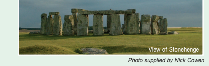
View of Stonehenge